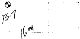
SITE PLAN N.T.S.